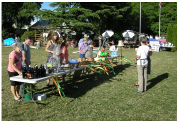
Rockin' the River fundraiser held at Rogue Farms raised over $1,500 for Ash Creek