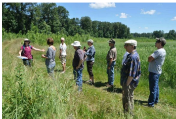
Board members and staff from the Marys River and Luckiamute Watershed Councils participated in a joint tour of LWC projects