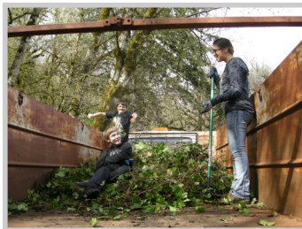
Students from Luckiamute Valley Charter School's (LVCS) Pedee Campus released trees and a fence line from invasive ivy at Polk County's Ritner Creek Park.

With funding from OWEB and MMT and partner support from LVCS and Polk County, ivy will be controlled and replaced with native plants.