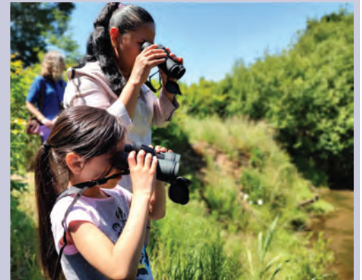
Left: Bird walk participants have fun practicing their binocular skills on a gorrión (sparrow). Right: Watching libélulas (dragonflies) and golondrinas (swallows) fly over Ash Creek was entertaining for all ages!