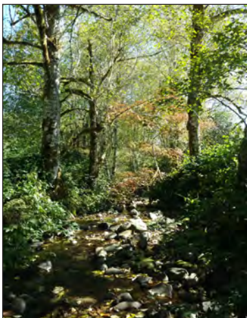
The South Fork Pedee Creek Enhancement Project will help restore salmon and trout habitat within a tributary to the Luckiamute River.

We are happy to report that our South Fork Pedee Creek Enhancement project is recommended for funding by the Oregon Watershed Enhancement Board (OWEB)! This is great news for the entire watershed community, and especially for steelhead and cutthroat trout, since this project area was ranked #1 for salmonid habitat through our watershed based modeling tool (NetMap).