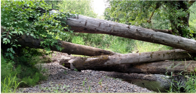
Because it provides many benefits to fish, "large wood" placement is an important part of many of our stream restoration projects.