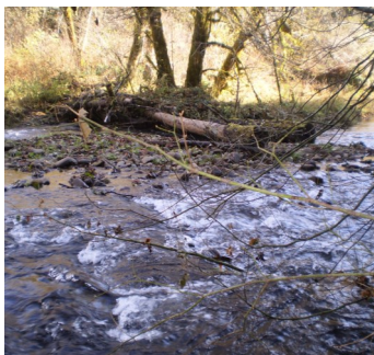
Upper Luckiamute River

Volunteer board members are the driving force of the Council and guide the direction of our work. Through Oregon statute and the local spirit of watershed councils, we seek to represent local stakeholders’ interests and perspectives. Anyone with an interest in the watershed is welcome to participate. See below for information about becoming a member.