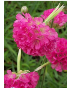
Sea pink, Armeria maritime

information. The Luckiamute Watershed Council is happy to assist in planning for enhancing vegetation on your land.