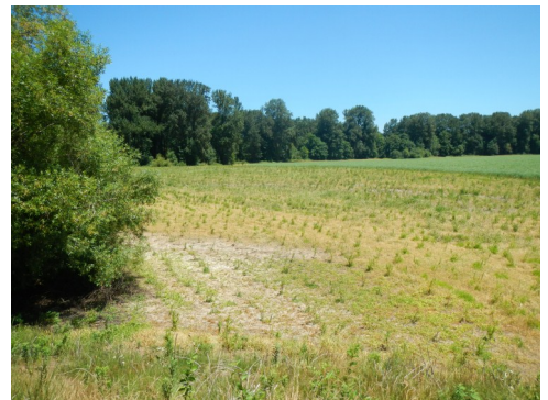
Phase I results: Invasive Reed Canary Grass (left) before restoration, native shrubs (right) after planting.