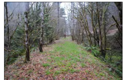
A view of the old Valley-Siletz Railroad berm at our Side Channel Reconnection Project site.