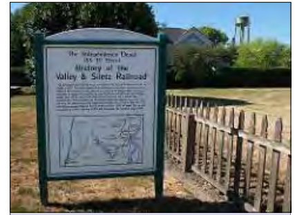
The new LWC office location features a little bit of local railroad history!

We also welcome you to stop by anytime to check out this part of our local history, talk about your hopes for the watershed, discuss any project ideas you might have, and share your experiences and knowledge with us. Our office phone number is the same, so feel free to call us at 503-837-0237 before stopping by to make sure we are not out in the field. Our own hope for this move is that our new location will inspire a fresh look at our role in the community, and help us get even better at engaging all of our stakeholders in watershed conservation. Stay tuned for an invitation to our Open House party later this summer to celebrate our big move!