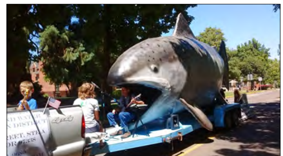
Our 2017 Grand Parade entry featured live banjo music, straight from the fish's mouth!