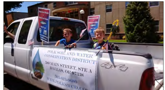
Our youngest volunteers are ready to help spread the word about keeping our streets and streams clean!