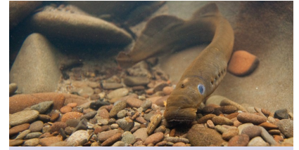
Our 2019 Sips 'n' Science pub talk focused on lamprey and local conservation efforts by the Tribes. https://youtu.be/x789W-Ecyes

and protect species that are important to Native American economy and culture. The Pacific lamprey ( Entosphenus tridentatus ) is an example of a native fish that is an extremely important food source and cultural resource for local Tribes, and is in decline across the Pacific Northwest. The life cycle and habitat requirements of Pacific lamprey are similar to that of our native salmonids, and they perform a similar ecological role of nutrient transport between marine and freshwater ecosystems. Yet it is only recently that funding to promote the recovery of lamprey populations is emerging amidst the ample grant opportunities for salmon-focused restoration.