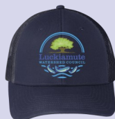
Our caps are one-size-fits-all with a Velcro closure. $30