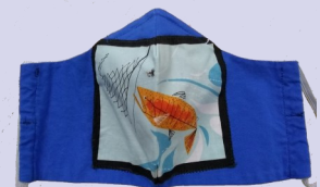
All facemasks have a nose wire and elastic ear loops. $7 each.