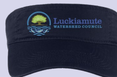
Our visors are one-size-fits-all with a Velcro closure. $30