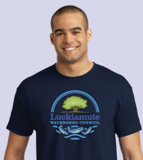
Our t-shirts come gray or navy, in Unisex and Ladies styles. $25

We now have a great selection of t-shirts, baseball caps, visors and zip-up hooded sweatshirts for sale on our website store! All clothing comes in multiple sizes, and features our full color logo. We also have some beautiful, hand-sewn face masks for sale, thanks to one of our talented volunteers. Check it out at LuckiamuteLWC.org/LWC-Store!