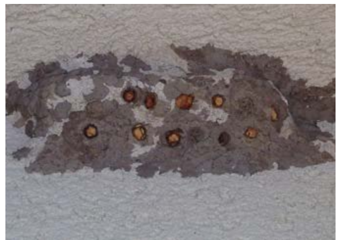
Fig. 4. Leafcutter bee cells in a mud nest built by dirt dauber wasps.