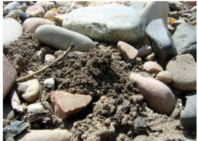
Fig. 2. Nest tumulus (soil heap) thrown up by the bee Halictus rubicundus nesting amid a decorative pebble mulch.