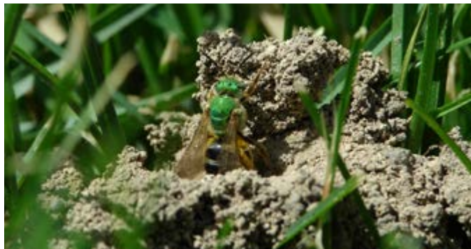
Fig. 1. Brilliant green Agapostemon bee emerging from a ground nest in a suburban lawn.

Utah is home to about 1,000 named species of native bees, with several hundred species living in any one valley and adjacent montane habitats. Urbanization takes its toll on native bees, but many species can persist with a little help from gardeners and landscapers. Like birds, bees have two primary needs in life: Food (for a bee, pollen and nectar) to feed themselves and their offspring, and a suitable place to nest. An earlier fact sheet ( Gardening for Native Bees in Utah and Beyond ) offers a rich tapestry of garden flowers that provide bees with nectar and/or pollen. We know far less about accommodating the nesting needs of our native bees, but there are certain practices that favor or disfavor their nesting.