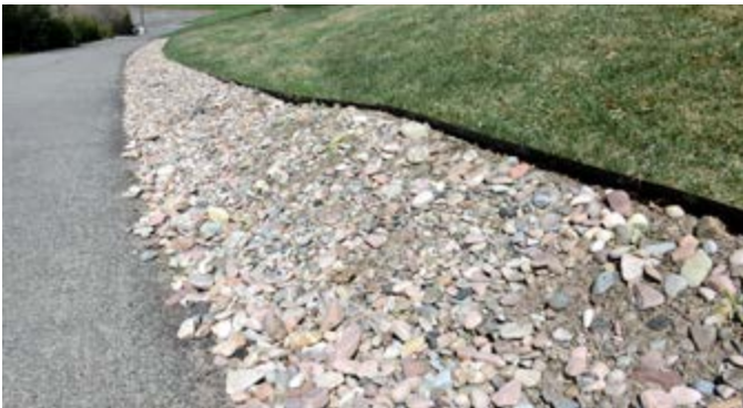
Fig. 5. A bare earth slope with nesting Halictus rubicundus bees was sodded in the fall to control erosion. Rather than sacrifice its nesting aggregation, however, a long strip of shallow rock pebble mulch was provided over bare soil. Several thousand emerging bees nested in the rock mulch strip the following spring.

Nest sites of seemingly suitable soil can be created, but many years may pass before the site is discovered by a colonist bee. Moreover, nests of many bee species have never been seen or described. For these reasons, there is little experimental evidence to guide gardeners and landscapers in the creation of attractive soil substrates for bees. Recent research shows that at least one common ground-nesting bee, Halictus rubicundus , prefers to nest amid a sparse surface mulch of stream pebbles or cobbles rather than in mere bare ground (Figs. 2 & 5). Vertical banks of heavier soil, if at least a foot high, will attract nesting by some bees, especially various sweat bees. In nature, these bees like to nest in cut-banks of streams. Keeping some small patches of well-drained bare sunny soil surfaces can attract nesting too.