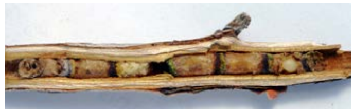
Fig. 3. Nest with cocoons of the bee Hoplitis sambuci excavated in the pith of a dead sumac twig.

Utah is home to about 1,000 named species of native bees, with several hundred species living in any one valley and adjacent montane habitats. Urbanization takes its toll on native bees, but many species can persist with a little help from gardeners and landscapers. Like birds, bees have two primary needs in life: Food (for a bee, pollen and nectar) to feed themselves and their offspring, and a suitable place to nest. An earlier fact sheet ( Gardening for Native Bees in Utah and Beyond ) offers a rich tapestry of garden flowers that provide bees with nectar and/or pollen. We know far less about accommodating the nesting needs of our native bees, but there are certain practices that favor or disfavor their nesting.