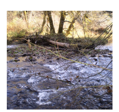
Upper Luckiamute River

Luckiamute Watershed Council Officer Elections