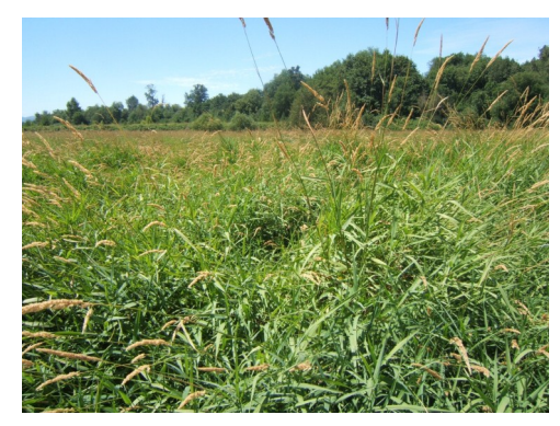
Phase I results: Invasive Reed Canary Grass (left) before restoration, native shrubs (right) after planting.

Join us on at 9:30 a.m. on January 1st as OPRD leads a hike for <u>America's State Parks</u> <u>First Day Hikes</u>. If water levels permit, we'll