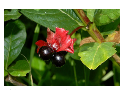
Twinberry, Lonicera involucrata