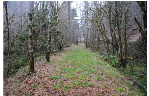
Pre-project, in-tact railroad berm

The Luckiamute Watershed Council completed the Side Channel Reconnection Project along the Upper Luckiamute River in summer 2013. By removing a section of the now defunct Siletz Railroad berm (photo, right), a meander bend previously connected to the Luckiamute River was reconnected. This side channel will provide excellent off-channel habitat for steelhead, cutthroat and other native fish. By opening this "detour", the side channel also provides passage around a bedrock step that was likely created by blasting during construction of the railroad (c. 1917) and was creating a barrier to juvenile steelhead during summer low flows (photo, below). Juvenile steelhead will now be able to access additional miles of cool waters in the upper Luckiamute River previously inaccessible. The project was completed with funding from the Oregon Watershed Enhancement Board, Meyer Memorial Trust, and invaluable contributions from Hancock Forest Management and the U.S. Fish and Wildlife Service.