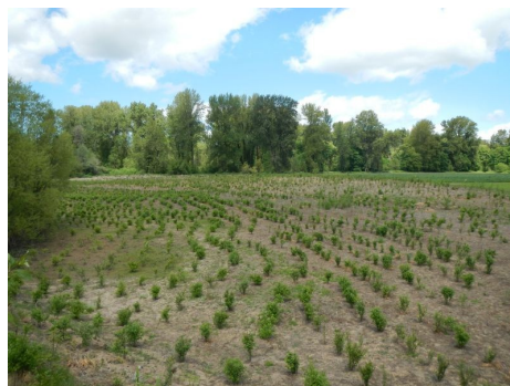
LSNA North Tract, Phase I area planted in 2012.

The Council is recruiting new board members and seeks individuals who work, live, or play in the watershed—you are a watershed stakeholder.