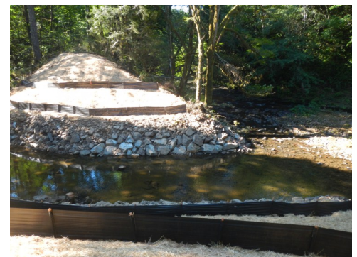
Left: Bedrock step that can now be passed through the side channel; Right: Newly opened side channel