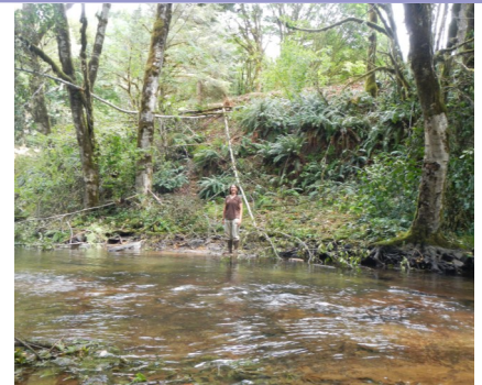
Kristen Larson, LWC Council Coordinator, stands under the now defunct Siletz railroad berm—showing how tall it is—near the side channel reconnection project on the Upper Luckiamute River.

August: The LWC is awarded OWEB Special Investment funds to install almost 4 miles of livestock exclusion fencing and conduct riparian enhancement on the Luckiamute River. Side Channel Reconnection Project is completed.