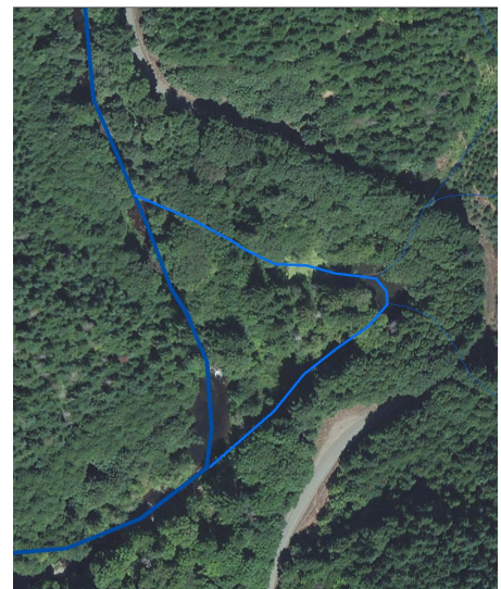
0 25 50 100 Feet Upper Luckiamute Side Channel Reconnection Project