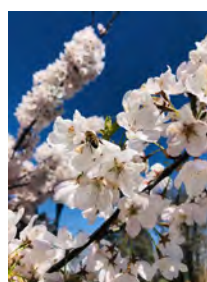
"Spring Bee" Ellen Burgess