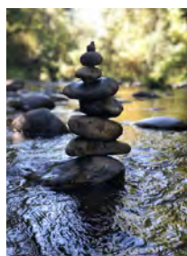
"Stack of Rocks" Katie Pickthorne