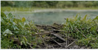
Beaver dam is causing flooding on my property.