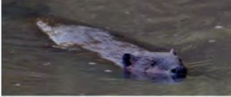
I want to support beavers living on my property and/or encourage them to move to my property.

The MWBP website allows you to explore a wide range of information and resources to help you solve specific types of beaver conflicts.